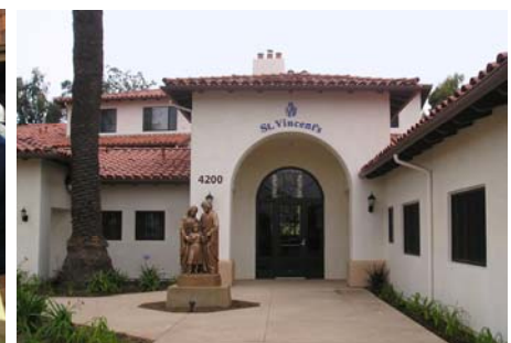
St. Vincent's Administration January 2008