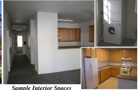
Sample Interior Spaces

These units are now available to low and very low income families with incomes at or below 60% of area median ($40,260 for a family of four). Units are equipped with refrigerators, range/oven units, and washer/dryer combinations. The development has tot lots, a community building, use of St. Vincent's swimming pool and abundant open space for individual gardens, play areas, and playing fields. A basketball court and baseball field have recently been completed.