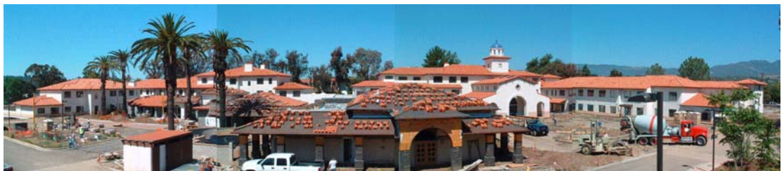
May 2007 Panoramic View of Senior Building behind St. Vincent's Administration Complex