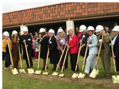
Groundbreaking September 2004